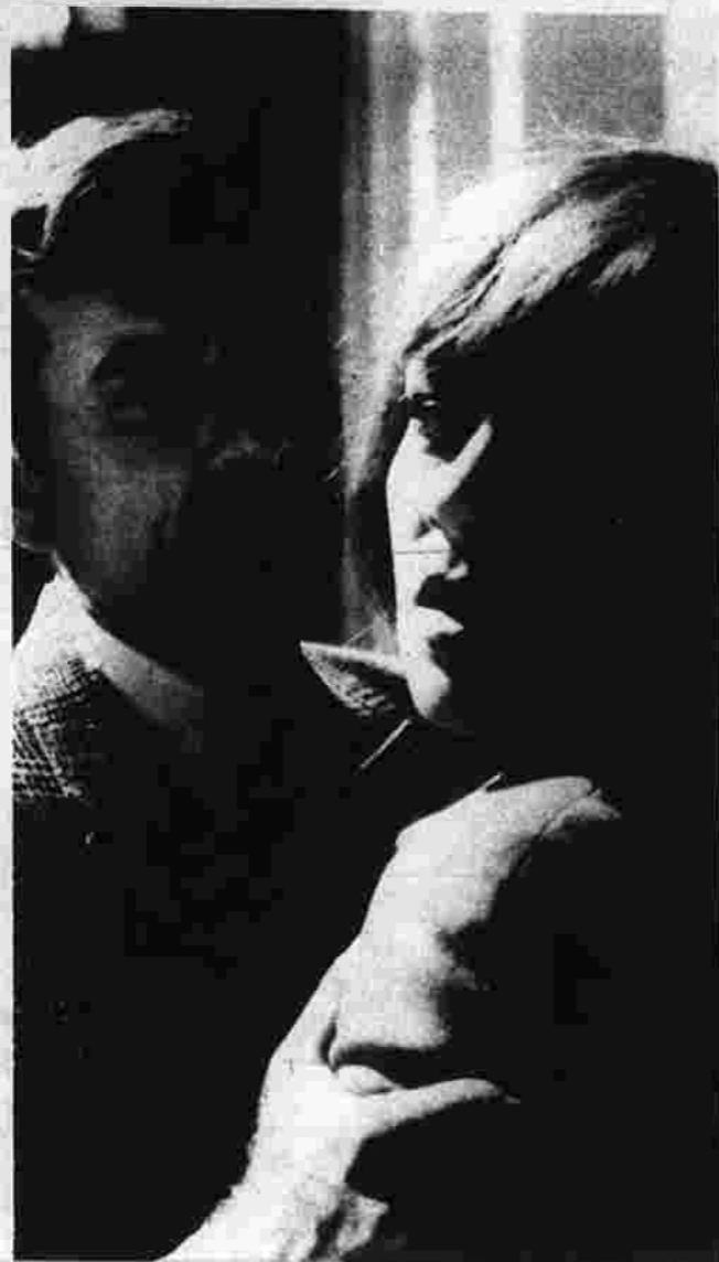
Nita Talbot, at left, is on the losing end with Mike Connors on CBS's "Mannix" today 10-11 p.m. Jean Marsh, below, is tight-lipped with Roger Moore, right, and Jeremy Burnham on NBC's "The Saint" today 7:30 to 8:30 p.m.