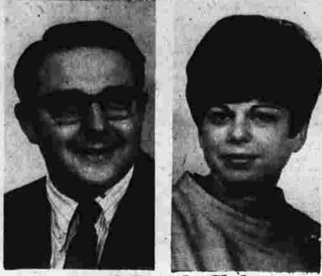
Head Temple Club

Proof of the allegations, the court said, would constitute a case of violation of the equal protection clause.